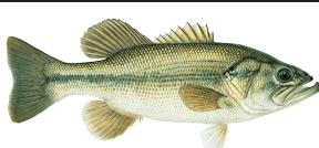
LARGEMOUTH BASS 2